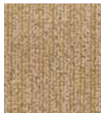
116 VENICE BEACH