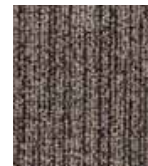
318 BUENA VISTA