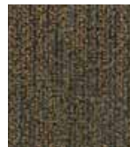
311 SHENANDOAH VALLEY