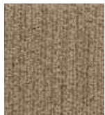
101 PACIFIC PALISADES

Style Number .....GT036 Style Name .....Arrival Modular Collection .....Sojourn Construction .....tufted Surface Texture .....textured multicolored cut & loop Gauge .....1/12 (47.00 rows per 10 cm) Density .....9,000 Weight Density .....198,000 Stitches Per Inch .....10.9 per inch (42.9/10 cm) Finished Pile Thickness .....088" (2.24 mm) Dye Method .....yarn dyed Backing Material .....EcoFlex ICT Face Yarn .....Antron® Legacy Nylon with DuraTech Soil Protection by Invista Fiber Technology .....Duracolor® by LEES Stain Resistant System. Passes GSA requirements for permanent stain resistant carpet. Face Weight .....22 oz/yd2 (746.02 gm/m2) Size/Width .....24" x 24" (60.9 cm x 60.9 cm) Installation Method .....quarter turn, vertical ashlar IAQ Green Label Plus .....1098 Pattern Repeat .....Not Applicable Warranties .....Lifetime Limited Modular Warranty, Lifetime Duracolor Stain Warranty, Lifetime Static