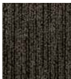
501 CENTRAL PARK