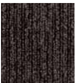
428 LOWER EAST SIDE