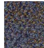
347 MOMA BLUE