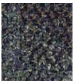
361 GLAZED GREEN