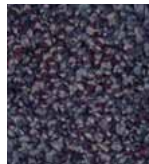
137 KLEE NAVY