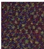
505 TATE BURGUNDY