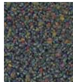
141 MIRO JADE