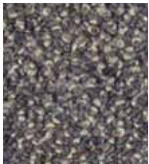
118 DEGAS GREY

Style Number ..... DI613 Style Name ..... Artstone III Modular Construction ..... tufted Surface Texture ..... textured loop graphics Gauge ..... 1/12 (47.00 rows per 10 cm) Density ..... 7,842 Weight Density ..... 172,524 Stitches Per Inch ..... 8.0 per inch (31.5/10 cm) Finished Pile Thickness..... .101" avg (2.6 mm) Dye Method ..... yarn dyed Backing Material ..... EcoFlex ICT Face Yarn ..... Antron® Legacy nylon 6,6 with DuraTech Soil ..... Protection by DuPont Fiber Technology ..... Duracolor® by LEES Stain Resistant System. Passes ..... GSA requirements for permanent stain resistant ..... carpet. Face Weight ..... 22 oz/yd2 (746.02 gm/m2) Size/Width ..... 24" x 24" (60.9 cm x 60.9 cm) Installation Method ..... monolithic IAQ Green Label Plus .1098 Pattern Repeat ..... Not Applicable Warranties ..... Lifetime Limited Modular Warranty, Lifetime Duracolor Stain Warranty, Lifetime Static