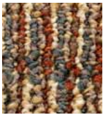
244 SADDLE BAG BEIGE