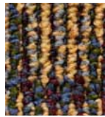
337 CACTUS FLOWER