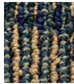
361 MOUNTAIN SHADOW