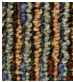
281 HIGH SIERRA