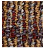
205 PRAIRIE SUNSET