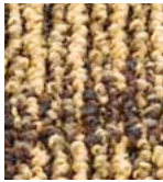
146 GOLD DUST