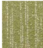
657 MAKE THE SCENE