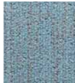
569 FLARE UP