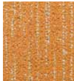
257 INTO SIGHT