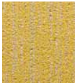
147 COME TO LIGHT