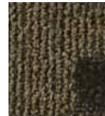
301 NATURE'S ESSENCE