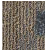
201 BEACH GLASS