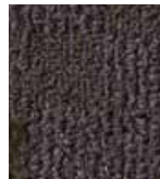
508 NORDIC SHADOW