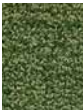
8656 Goes With