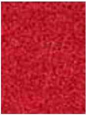
8333 Same As