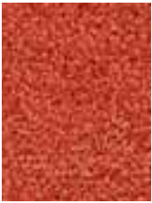
8253 This One