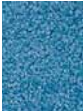
8536 Sure Fit