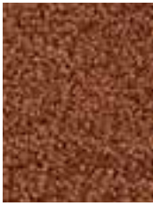
8822 Match Up