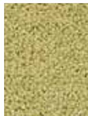
8611 In Cahoots