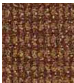
434 AUTUMN BROWN