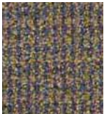
207 SHIMMERING BLUE

Style Number ..... GL051 Style Name ..... Deauville Collection..... Modern Order Construction ..... tufted Surface Texture ..... textured multi-colored cut and loop Gauge ..... 5/64" (50.4/10 cm) Density ..... 6,632 Weight Density ..... 139,272 Stitches Per Inch ..... 9.0 per inch (35.4/10 cm) Protective Treatment... DuraTech Soil Protection by Invista Finished Pile Thickness .114" (2.90 mm) Dye Method ..... yarn dyed/solution dyed Backing Material ..... Unibond Flex Face Yarn ..... Antron® Legacy Nylon 6,6 Fiber Technology ..... Duracolor® by LEES Stain Resistant System. Passes GSA requirements for permanent stain resistant carpet. Face Weight ..... 21 oz/yd2 (712.11 gm/m2) Size/Width ..... 12' width (3.66 m) IAQ Green Label Plus.. 4952 CRI Rating..... Moderate Traffic Pattern Repeat ..... .63" (W) x 4.00" (L)