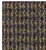
307 WATERCOLOR BLUE