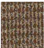
421 SOUTHERN PINE