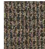
341 SEA GREEN