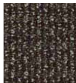
451 LILY POND