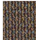
404 AGED EUCALYPTUS