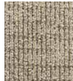
639 FOUNDATION OF LAW