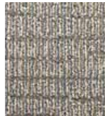
557 PRIMITIVE LEGEND