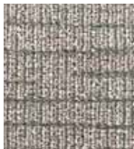
945 SPECIFIC FABLE