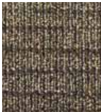
996 TRADITIONAL FOLKLORE