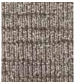
869 PEACEFUL WISDOM