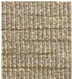
146 CULTURAL ORIGIN

Style Number..... GL122 Style Name ..... Defined Passage Collection..... Tradewinds Construction ..... tufted Surface Texture..... Textured Patterned Loop Gauge ..... 1/10 (39.37 rows per 10 cm) Density..... 4865 Weight Density..... 97300 Stitches Per Inch..... 10.2 (40.16 per 10 cm) Finished Pile Thickness....148" (3.76 mm) Dye Method..... Solution Dyed Backing Material..... Unibond Flex Fiber Type ..... Duracolor® Premium Fiber Fiber Technology ..... Duracolor® by LEES Stain Resistant System. Passes GSA requirements for permanent stain resistant carpet. Face Weight..... 22 oz/yd2 (746.02 gm/m2) Size/Width ..... 12' width (3.66 m) IAQ Green Label Plus.. 9226 CRI Rating..... Severe Traffic Pattern Repeat ..... 24" (W) x 41.6" (L) Warranties ..... Lifetime Limited Unibond Flex Warranty, Lifetime Duracolor Stain Warranty, Lifetime Static