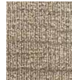
837 PRECISE FOCUS