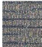
586 VISUAL RITUAL