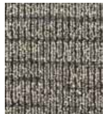
979 EDGY IDEA