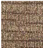
371 MODERATE ETHICS