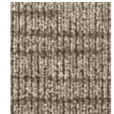
866 UNRELENTING HABIT