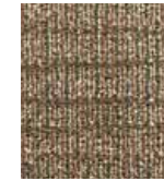
863 SOMBER TALE