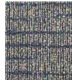
586 VISUAL RITUAL