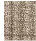
837 PRECISE FOCUS