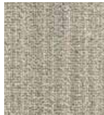
201 GREEN TINT