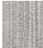
228 CASTLE GREY