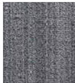
357 SHADOW BLUE