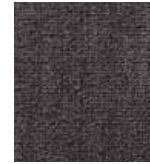
538 SMOKED KOHL