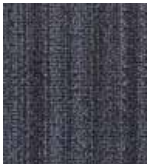
507 PERSIAN BLUE