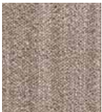
354 BEACH TAN