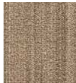
406 BURNISHED GOLD