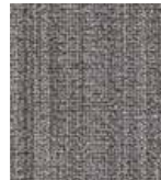
328 FLINT STONE