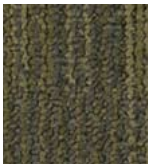
406 BURNISHED GOLD