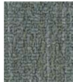
228 CASTLE GREY