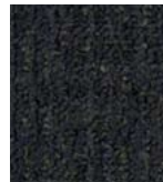
538 SMOKED KOHL