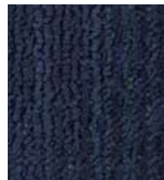
507 PERSIAN BLUE