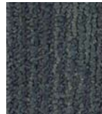
328 FLINT STONE