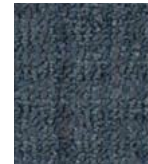
357 SHADOW BLUE