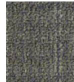
354 BEACH TAN