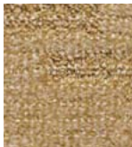
116 VENICE BEACH