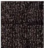
428 LOWER EAST SIDE