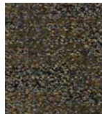
311 SHENANDOAH VALLEY