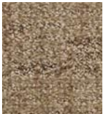
101 PACIFIC PALISADES

Style # .....GT038 Gauge .....1/12" (47.0/10 cm) Dye Method.....Yarn dyed Backing Material .....ICT - Fiberglass Reinforced Thermoplastic Composite Tile IAQ Green Label Plus.....4338 Face Yarn .....Antron® Legacy nylon 6,6 with DuraTech Soil Protection by Invista Fiber Technology .....Duracolor® by Lees Stain Resistant System. Passes GSA requirements for permanent stain resistant carpet Size/Width.....24" x 24" (60.9 cm x 60.9 cm) Pattern Repeat.....n/a