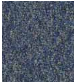
1247 BLUE LAGOON

Style Number..... L2746 Style Name ..... Faculty Classics Construction ..... tufted Surface Texture..... textured loop Gauge ..... 1/8 (31.50 rows per 10 cm) Density..... 6,882 Weight Density ..... 178,932 Stitches Per Inch..... 8.3 per inch (32.68/10 cm) Finished Pile Thickness .136" avg (3.5 mm) Dye Method..... yarn dyed Backing Material..... Unibond Flex Face Yarn ..... Fortis 6,6 Nylon with Sentry Soil Protection Face Weight..... 26 oz/yd2 (881.66 gm/m2) Size/Width ..... 12' width (3.66 m) IAQ Green Label Plus.. 4952 Pattern Repeat ..... n/a