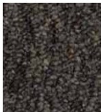
3328 MOUNTAIN GREY