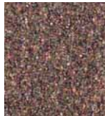
3033 AMBER LIGHTS