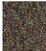
3338 FIELD STONE