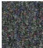
3337 LAPIS BLUE