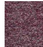
3713 OLD PORT