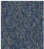
1247 BLUE LAGOON

Style # .....L2743 Gauge .....1/8" (31.5/10 cm) Dye Method..... Yarn dyed Backing Material .....ICT - Fiberglass Reinforced Thermoplastic Composite Tile IAQ Green Label Plus.....4338 Face Yarn .....Fortis 6,6 Nylon with Sentry Soil Protection Fiber Technology ..... Size/Width..... 24" W x 24" L (60.9 cm x 60.9 cm) Installation Method ..... Monolithic