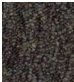
3328 MOUNTAIN GREY