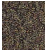
3338 FIELD STONE