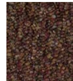
3564 CANYON SUNSET