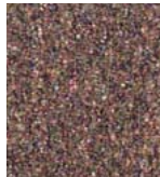
3033 AMBER LIGHTS