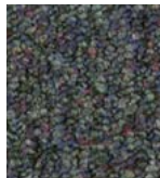
3337 LAPIS BLUE