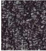
508 CHARCOAL GREY