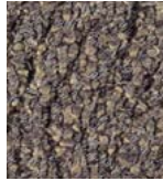
524 STEPPING STONE