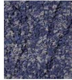
537 STORMY PEAK