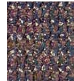
304 EARTHLY TAUPE