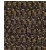
444 BROWN TONES