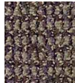
221 ASH GREEN