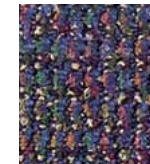
507 INDIA INK