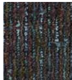
518 LAGUNA SECA