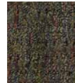
211 LIME ROCK