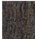
524 MONTE CARLO