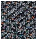
208 SILVER LAKE