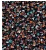
235 MAUVE TONES