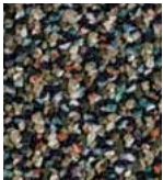
201 NEW LEAF

Style Number .....LE023 Style Name .....InTown Modular Construction .....tufted Surface Texture .....level loop Gauge .....1/10" (39.4/10 cm) Density .....8,500 Weight Density .....144,500 Stitches Per Inch .....9.5 per inch (37.4/10 cm) rev 1/06 Finished Pile Thickness .072" avg (1.8 mm) rev 1/06 Dye Method .....17% yarn dyed and 83% solution dyed Backing Material .....EcoFlex ICT Face Yarn .....Fortis Nylon Fiber Technology .....Averta Stain Protection Face Weight .....17 oz/yd2 (576.47 gm/m2) Size/Width .....24" x 24" (60.9 cm x 60.9 cm) Installation Method ....monolithic IAQ Green Label Plus..1098 Pattern Repeat .....Not Applicable Warranties ..... Lifetime Limited Modular Warranty, Lifetime Static