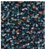
327 BLUE TURQUOISE