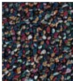
337 AURORA BLUE