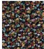
301 GREEN ABALONE