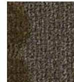
308 BRONZE SCULPTURE