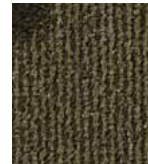
301 NATURE'S ESSENCE