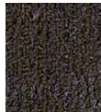
508 NORDIC SHADOW