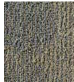
201 BEACH GLASS