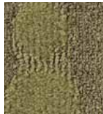
124 BAMBOO SPROUT