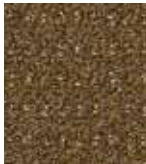
234 WELDING BROWN