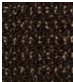
534 WOOD ASH