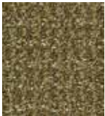
201 ALLOY GREEN

Style Number ..... DG903 Style Name ..... MetallicGrid Modular Construction ..... tufted Surface Texture ..... textured loop Gauge ..... 5/64" (50.4/10 cm) Density ..... 8,471 Weight Density ..... 203,304 Stitches Per Inch ..... 11.5 per inch (45.3/10 cm) Finished Pile Thickness .102" avg (2.6 mm) Dye Method ..... yarn dyed Backing Material ..... EcoFlex ICT Face Yarn ..... Antron® Legacy nylon 6,6 with DuraTech Soil Protection by DuPont Fiber Technology ..... Duracolor® by LEES Stain Resistant System. Passes GSA requirements for permanent stain resistant carpet. Face Weight ..... 24.0 oz/yd 2 (814 g/m 2 ) Size/Width ..... 24" x 24" (60.9 cm x 60.9 cm) Installation Method .... quarter turn IAQ Green Label Plus.. 1098 Pattern Repeat ..... Not Applicable Warranties ..... Lifetime Limited Modular Warranty, Lifetime Duracolor Stain Warranty, Lifetime Static