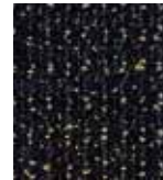
457 COBALT BLUE