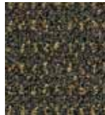
307 MATRIX BLUE