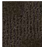
508 NORDIC SHADOW