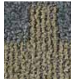
201 BEACH GLASS