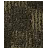
301 NATURE'S ESSENCE