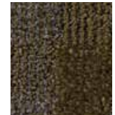
308 BRONZE SCULPTURE