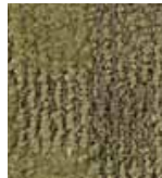
124 BAMBOO SPROUT