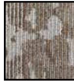
128 SECOND LOOK