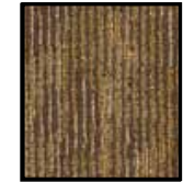
306 AT A GLANCE