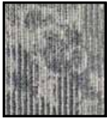
107 OUT OF SIGHT

Style # .....GT078 Gauge .....1/12 (47.00 rows per 10 cm) Dye Method.....Solution dyed/Yarn dyed Backing Material .....ICT - Fiberglass Reinforced Thermoplastic Composite Tile Face Yarn .....duracolor ® Premium Fiber Fiber Technology .....duracolor ® by LEES Stain Resistant System. Passes GSA requirements for permanent stain resistance. Provides stain, fade, and soil resistance. Size/Width.....24" x 24" (.6096 m x .6096 m) Installation Method .....Quarter Turn IAQ Green Label Plus.....4338 CRI Rating.....Heavy Traffic