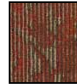
302 EYE FULL