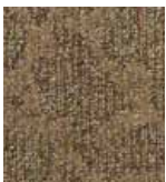
421 SOUTHERN PINE