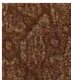
434 AUTUMN BROWN