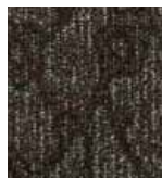
451 LILY POND