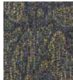
207 SHIMMERING BLUE