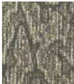
108 GREY DAWN