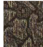
404 AGED EUCALYPTUS