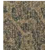
341 SEA GREEN