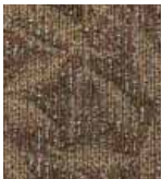
421 SOUTHERN PINE