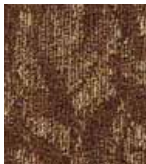
434 AUTUMN BROWN