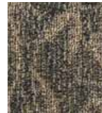
341 SEA GREEN