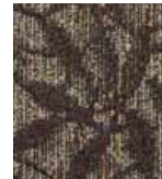
404 AGED EUCALYPTUS