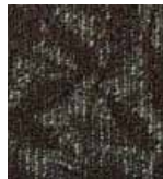
451 LILY POND