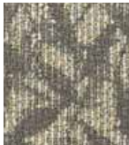
108 GREY DAWN