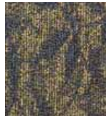
207 SHIMMERING BLUE