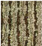
101 BUTTON DOWN

Style Number .....GT010 Style Name .....Tie Modular Collection.....Menswear Construction .....tufted Surface Texture .....patterned loop Gauge .....1/10" (39.4/10 cm) Density .....7,059 Weight Density .....141,180 Stitches Per Inch .....12.5 per inch (49.21/10 cm) Finished Pile Thickness .102" avg (2.5 mm) Dye Method .....yarn dyed Backing Material .....EcoFlex ICT Face Yarn .....Antron® Legacy nylon 6,6 with DuraTech .....Soil Protection by DuPont Fiber Technology .....Duracolor® by LEES Stain Resistant System. .....Passes GSA requirements for permanent .....stain resistant carpet. Face Weight .....20 oz/yd2 (678.2 gm/m2) Size/Width .....24" x 24" (60.9 cm x 60.9 cm) Installation Method ....quarter turn, brick ashlar IAQ Green Label Plus..1098 Pattern Repeat.....Not Applicable Warranties ..... Lifetime Limited Modular Warranty, Lifetime Duracolor Stain Warranty, Lifetime Static