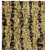
106 TAB COLLAR