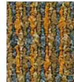
226 WATCH POCKET