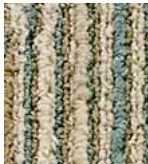
104 FRENCH CUFF