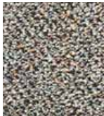
218 HAMMERED TIN