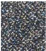
327 TWILIGHT FORMAT