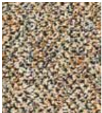
214 SANDY SHORE

Style Name .....Work It! 26 Style Number .....GL143 Brand .....Lees Product Type .....Broadloom Construction .....Tufted Surface Texture .....Level Multi-Colored Loop Gauge .....1/10 (39.37 rows per 10 cm) Density .....6933 Weight Density .....180,258 Stitches Per Inch .....11.8 (46.46 per 10 cm) Finished Pile Thickness .135" (3.43 mm) Dye Method .....Solution Dyed/Space Dyed Backing Material .....UniBond Flex Face Yarn .....duracolor® Premium Nylon Fiber Technology .....Duracolor® by LEES Stain Resistant System. Passes GSA requirements for permanent stain resistant carpet. Duracolor® by LEES Stain Resistant System. Passes GSA requirements for permanent stain resistant carpet. Face Weight .....26 oz. per sq. yd. (882 g/m2) Pattern Repeat .....0.4" (W) x 0.4" (L) Protective Treatment ..Sentry Plus IAQ Green Label Plus .9226 CRI Rating .....Severe Traffic Static .....AATCC-134 Under 3.5 KV Flammability .....ASTM E 648 Class 1 (Glue Down) Smoke Density .....ASTM E 662 Less than 450 Warranties .....Lifetime Limited Unibond Flex Warranty. Lifetime Duracolor Stain Warranty. Lifetime Static