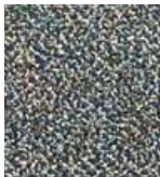
337 SLATENED SKY