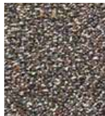
418 BURNISHED IRON