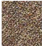
228 NATURAL HYBRID