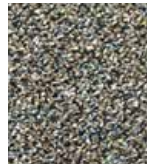
311 CHAMELEON FOIL