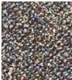
421 METAL WORKS